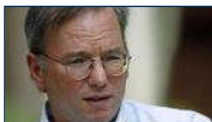
Google CEO to discuss his role on Apple's board