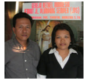
Indonesia - Pastor Forces to Stop Worship Services in Home