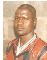
Nigeria - Six Pastors Killed, 40 Churches Razed in Jos Violence