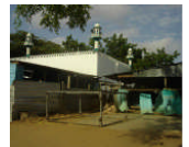
Kenya - Islamists Attack Church in Northern Town