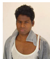
Bangladesh - Muslim Pilgrims Beat Bible Student