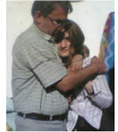
Iraq - Court Releases Christian Girl Sentenced for Murder