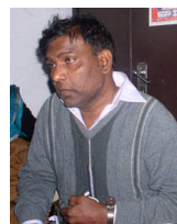
Pakistan - Christian Charged with 'Blasphemy for Text Message