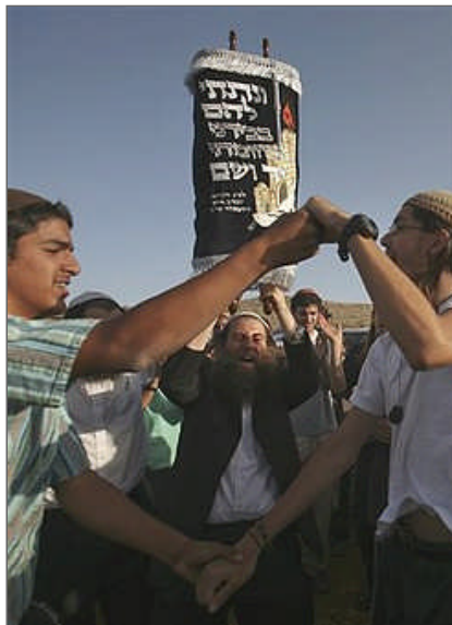
Settlers dedicate a Torah scroll in the West Bank outpost of Maoz Esther, which has been dismantled and rebuilt several times in recent weeks.