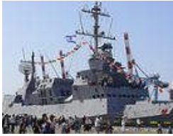
Britain Punishes Israel for Anti-Hamas Offensive

the Jerusalem chapter of Fatah, says openly that the PA will resume violence and terror against Israel when Fatah is "capable," and "according to what seems right."