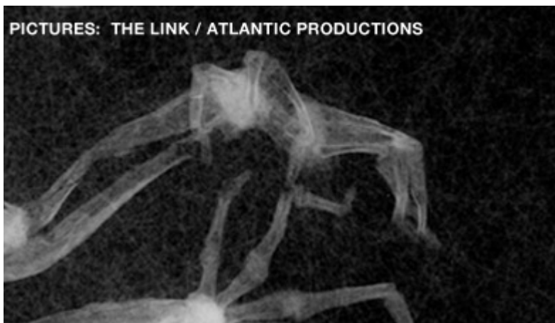
ray of Ida 's badly fractured left wrist

his is really something that the world has never seen before, this is a unique specimen, totally unique," he says, clearly otional.