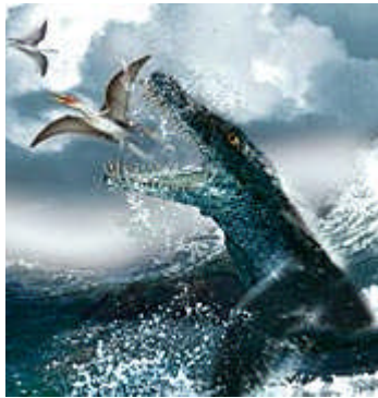
Hurum also found Predator X

e study is being published and put online by the Public Library of Science, a leading academic journal with offices in Britain and the US.