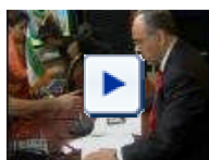
Iran's news via Los Angeles Play Video