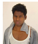
Bangladesh - Muslim Pilgrims Beat Bible Student