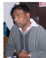
Pakistan - Christian Charged with 'Blasphemy' for Text Message