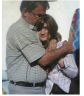
Iraq - Court Releases Christian Girl Sentenced for Murder