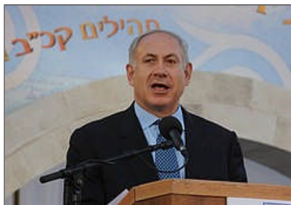
Prime Minister Binyamin Netanyahu speaks at a Jerusalem Day ceremony, Thursday.