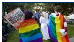
New England economy could see gay-marriage boost