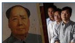
Full Coverage: China, 20 years after Tiananmen