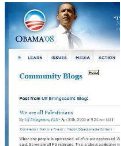
"We are all Palestinians" post

The readers of Obama's site were called upon to "take urgent action. Just 3 phone calls and 1 E-mail to make a difference."