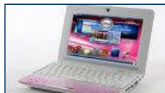
Disney unveils kids' laptops amid shopper thrift