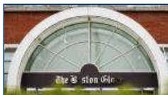
Blog: Boston Globe -- a real conversation starter