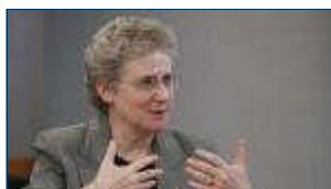
Investment Outlook Summit: Don't worry about inflation