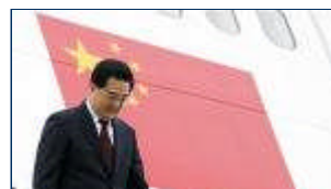
Full Coverage: BRIC leaders seek voice at first summit