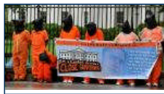
Commentary: Obama and the wrong side of history