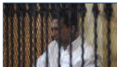
Egyptian billionaire sentenced to death for pop star's murder